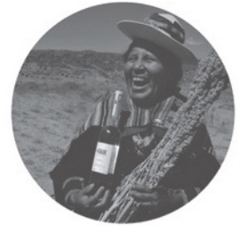
FAIR TO THE FARMERS