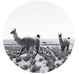
FAIR TO THE PLANET