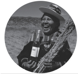
FAIR TO THE FARMERS