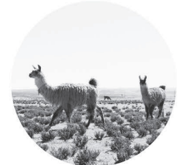
FAIR TO THE PLANET