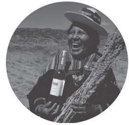
FAIR TO THE FARMERS