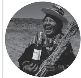
FAIR TO THE FARMERS