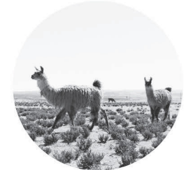
FAIR TO THE PLANET