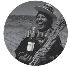
FAIR TO THE FARMERS