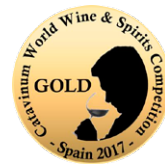
Gold Medal CATAVIUM WORLD WINE & SPIRITS COMPETITION