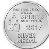
Silver Medal SAN FRANCISCO WORLD SPIRITS COMPETITION