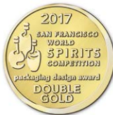
Double Gold Medal PACKAGING DESIGN AWARD SAN FRANCISCO WORLD SPIRITS COMPETITION

If UV light falls onto the bottle at any time, its fluorescent colours reveal the hidden side of Padró & Co. Rojo Amargo.